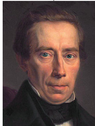
Johan Rudolf Thorbecke (1798–1872)