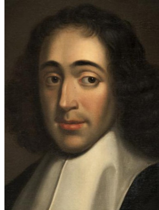
Baruch de Spinoza (1632–1677)

Spinoza was the origin of much debate and ultimately change of opinion in the period 1650–1750, and all over Europe, although Hobbes was more influential in Britain. Spinoza was widely seen as an atheist. He denied the existence of miracles—a major issue at the time—and was a radical free thinker. Spinoza believed that motion is inherent in matter and that Nature is self-moving; he rejected divine providence and the idea that a God governs man's destiny. Spinoza also argued in favor of natural liberty, which included individual freedom, liberty of thought, and radical toleration. He was the first major European thinker to embrace democratic republicanism, including political freedom for all citizens (Israel 2001, 159–294; 2007, viii–ix). He is seen as the first modern thinker (as opposed to medieval), even more so than Descartes, because Spinoza “cut the ties with religious tradition as a source of information, instead relying upon natural means to arrive at the philosophical truth,” although he was no atheist. In his view of human nature he saw the passions and reason as two more or less equal sources of human conduct, without one necessarily being superior over the other (Feldman 1992).