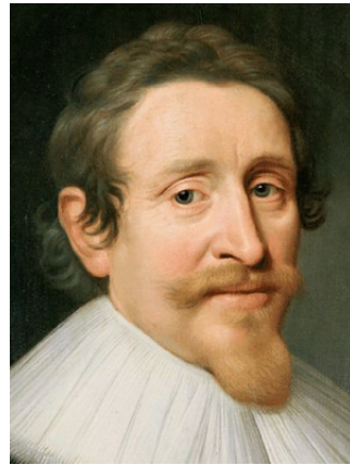
Hugo Grotius (1583–1645)

Born in Delft, Grotius' extraordinary talents were discovered at young age, entering Leiden University at the age of 11. King Henry IV of France even called him "the miracle of Holland." Nowadays, Grotius is perhaps best known for his work De Jure Bellis ac Pacis (1625), the declared purpose of which is to treat justice between nations, but to do so Grotius first discussed justice between individuals, so the massive work covers much more than international law. He also published many treatises and books throughout his life, not least in theology. His earlier book Mare Liberum (1609) discusses the limits of the rights of sovereigns to restrict travel and shipping on open waters. His first years he spent as advocate-