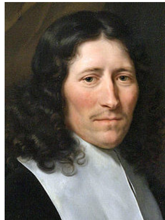
Pieter de la Court (1618–1685)