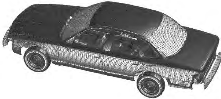
Illustration 1: Finite element model of a Ford Taurus

Each of the little quadrilateral areas shown in the illustration is a finite element. At each node where element boundaries intersect, six independent displacement variables are defined (three translations, three rotations), and an entire model may contain hundreds of thousands or even millions of variables. Forward integration in time is carried out using finite difference approximations to compute the response of the system to loads such as the impact forces in a crash simulation. An automobile is a challenging structure to model and the response to a crash impact is highly nonlinear, so successful modeling and numerical integration is a major challenge.